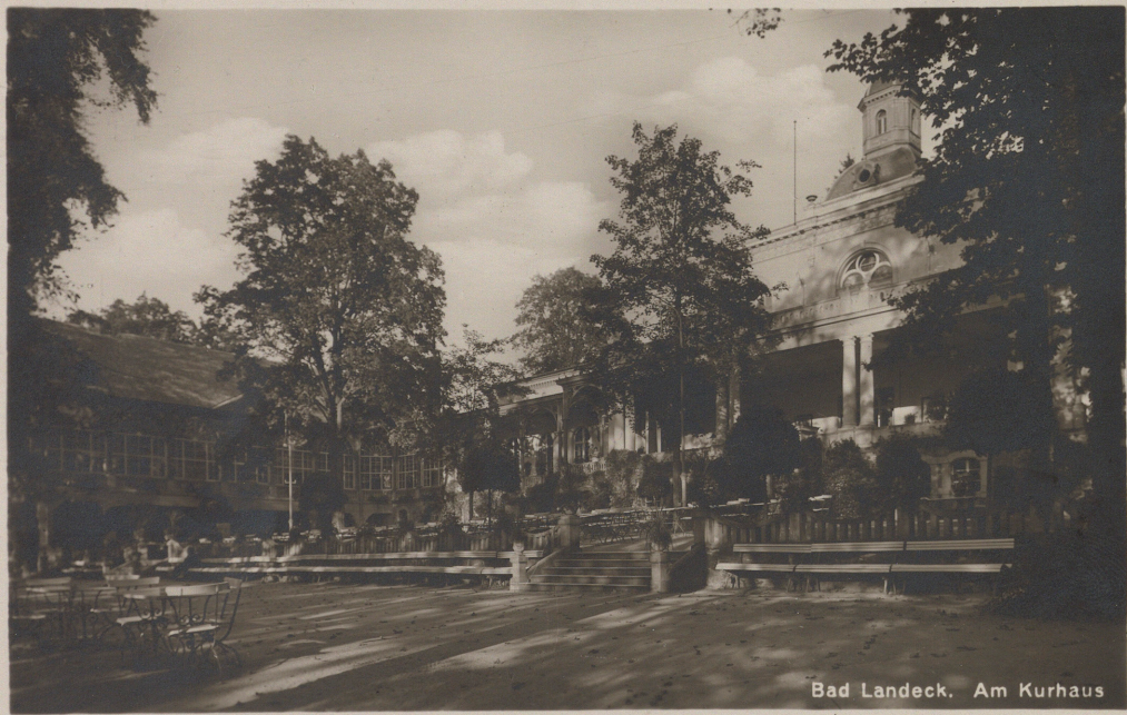
Bad Landeck. Am Kurhaus